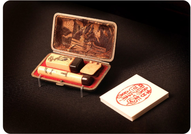
Collection of Ms. Pauline Tan Siew Wah

A Chinese seal is usually used as a stamp to print a person's name on paper to represent one's signature. Some seals may also include personal motto or a sentence from a poem.